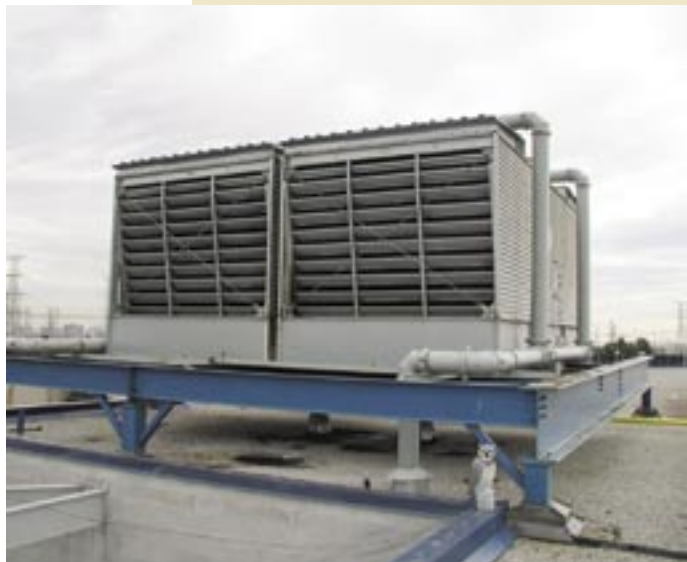
Rejecting heat outdoors can involve steel or FRP tower cells, remote condensers and specialized NEMA rated controls.