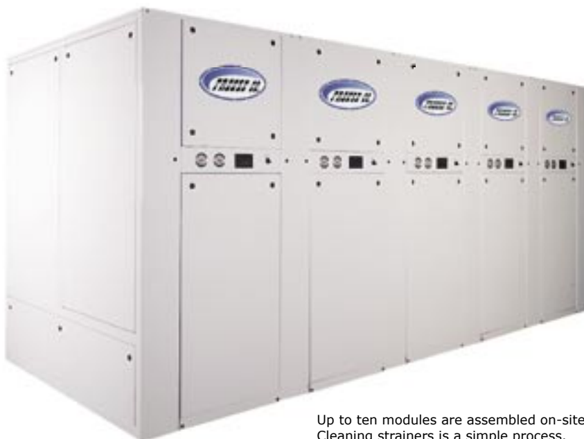
Up to ten modules are assembled on-site. Cleaning strainers is a simple process.