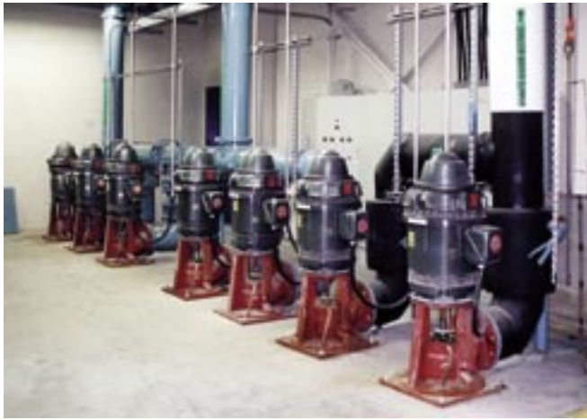
Central tanks to 10,000 gallons and equipped with mounted pumps, heat exchangers and filters prepped and wired.

Our work with some of the worlds largest and most productive customers confirms that adequate reservoir volume is a worthwhile investment. In-ground concrete reservoirs using vertical turbine pumps or fabricated steel tanks from 150 to 10,000 gallons with end suction pumps are common requirements. We have built systems where tower and chilled water tanks are below ground; pumps, closed loop heat exchangers and full stream filters are above the tanks; and central chiller banks and controls are on the upper mezzanine. Evaporative towers are roof