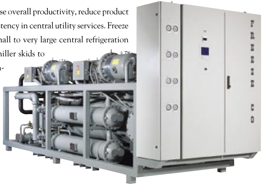
Central chiller skids using recip and screw compressors. Model shown is 400HP.

Customers are looking for ways to increase overall productivity, reduce product and process variance, and provide consistency in central utility services. Freeze Co has extra-ordinary experience in small to very large central refrigeration systems. Systems that include staged chiller skids to provide close capacity matching, redundancy and remote system control. Energy saving pumps, fans and controls, highly consistent chilled water pressure and temperature delivery, floor space savings, free-cooling modes and remote diagnostics and monitoring of performance are characteristic of our water system experience.